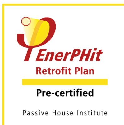
Pre-certification seal for staged retrofits

These seals may only be used in connection with the certified building.