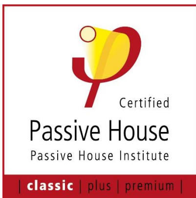
Passive House seal

When the Certifier has established the technical accuracy of the necessary evidence for the examined building in accordance with Subsection 3.2 (or Subsection 3.3 in the case of pre-certification for a staged retrofit), and if the building meets the criteria in Section 2, the Certifier will issue the applicable seal: