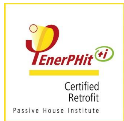
EnerPHit + seal (for buildings with mostly interior insulation)